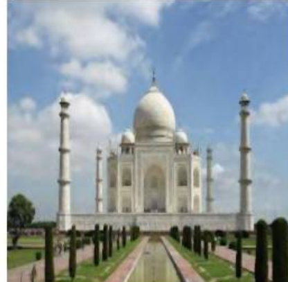
Fig(10):Second stage denoised image using external correlations.

The second stage registered image is again denoised in the second stage using both internal and external correlation based algorithms. The second stage internal correlation based denoised image is shown in figure(9) and the second stage external correlation based denoised image is shown in figure(10).