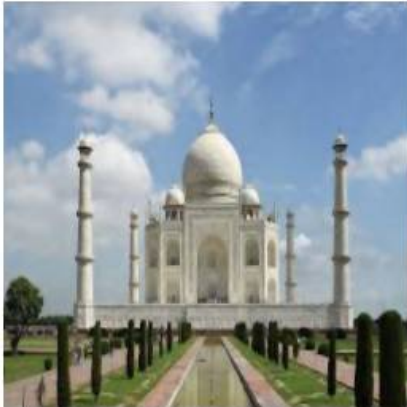
Fig(9):Second stage denoised image using external correlations.