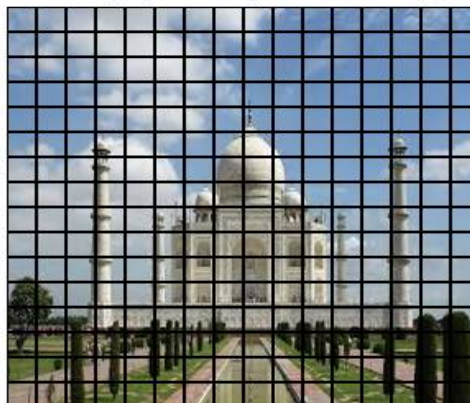
Fig(6):First stage denoised image using external correlations.

Whereas the first stage denoised image using external correlations is shown in figure (6). In this first stage external correlation based denoising approach we have used the graph cut based patch matching algorithm.