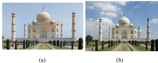
Fig(2):Original Images,(a)test image ,(b)web version.

The proposed denoising approach is designed, coded, implemented and tested in the matlab environment and the simulation results are presented as follows.