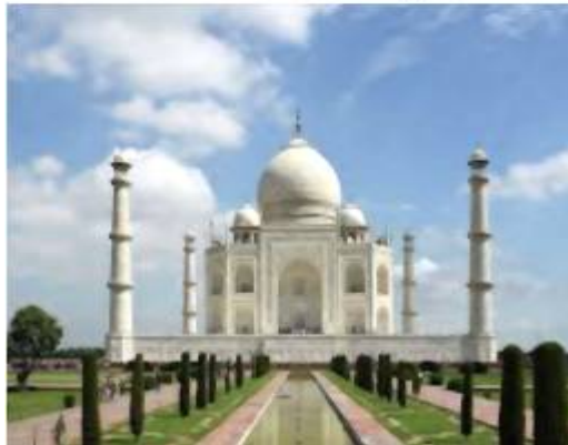
Fig(11):Final Denoised Image.

Finally we combine the denoised images of both internal and external correlative methods of the second stage to get the final denoised image as shown in figure (11).