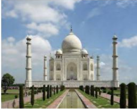
Fig(7):First stage combined denoised image .