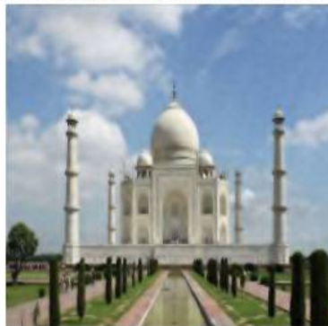
Fig(5):First stage denoised image using internal correlations.

The noise degraded image is initially denoised in the first stage using both internal and external correlative techniques. The first stage denoised image using internal correlations is shown in figure (5).